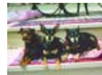
Pet of the Week